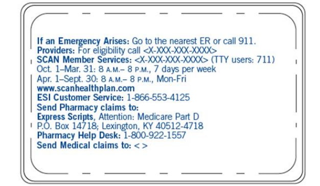
Note: SCAN logo on Member ID card will appear slightly different based on state e.g., AZ: SCAN Desert Health Plan